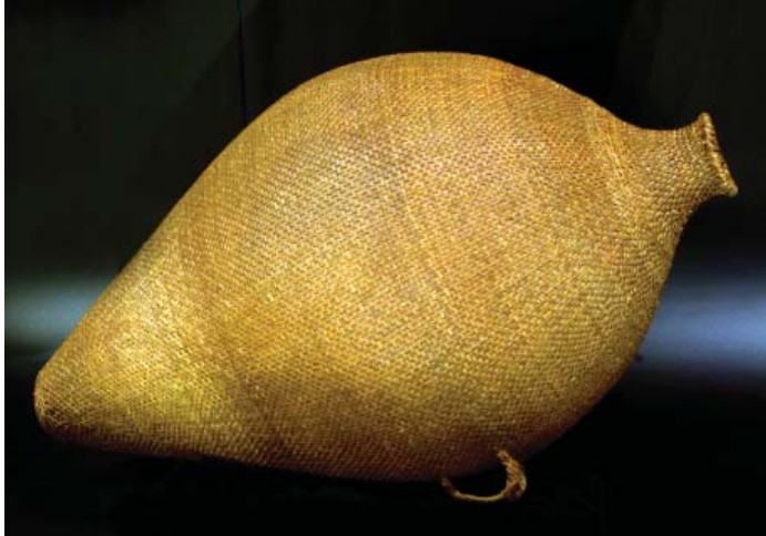
Paiute Water Bottle Willow Shoots, split willow, dogbane cordage, red earth Diagonal three-strand twining Mono Co. ~ Inyo Co. c. 1890

A Paiute woman made this lightweight and durable water container basket in 1890. As you can imagine, baskets intended to hold liquids had to be woven very tightly. Before use, they also were covered in pine pitch sap and then rolled in dirt to create a watertight seal. Since there was not a lot of fresh water readily available for the Paiute people (who live on the dry eastern side of the Sierra Nevada Mountains), they needed to store water. This basket would be able to hold enough fresh water for one person for one day.